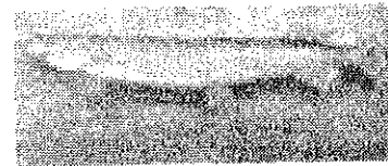
Nice Northern Pike!